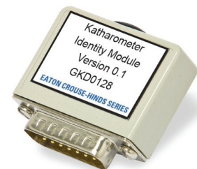
Figure 2 - KIM

Each sensor assembly is supplied with a Katharometer Identity Module (KIM) - see Figure 2. The KIM attaches to the analyser electronics and uniquely identifies the sensor and its calibration curves. This enables fast replacements to be made with no need for extended analyser downtime or lengthy calibration procedures.