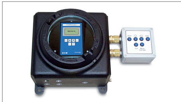
K1550FX electronics unit in optional EEx enclosure with remote keypad