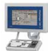
Wall mounting (on request)