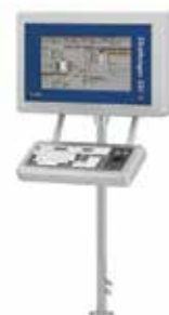
Floor mounting (standard)