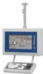
Ceiling mounting (on request)