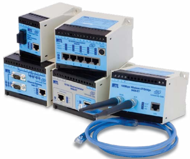
MTL 946X series of Intrinsically Safe Ethernet modules

A combination of Intrinsically Safe PoEX™ and conventional (depending on Area Classification) products are selected to provide complete wireless 802.11 coverage of the plant operating areas.