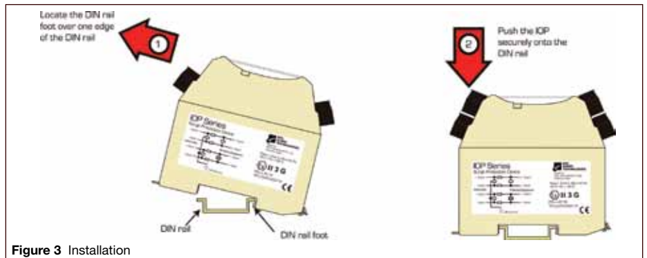
Figure 3 Installation