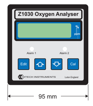
Display / Control unit