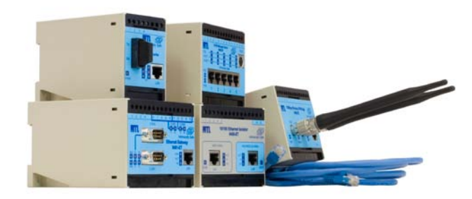
MTL 946X series Intrisically Safe Ethernet modules

Wireless infrastructure can also be used to provide communication, process status or maintenance procedures to mobile workers'. This enables personnel to access realtime process data or instructions for any task they may be performing in the field thereby increasing worker efficiency.