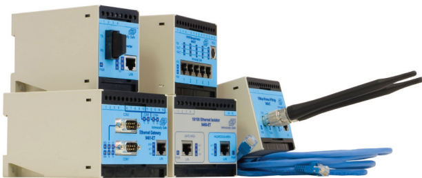
MTL 946X range of Intrinsically Safe Ethernet modules

Wireless infrastructure can also be used to provide communication, process status or maintenance procedures to mobile workers'. This enables personnel to access real-time process data or instructions for any task they may be performing in the field thereby increasing worker efficiency.