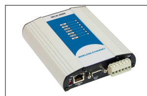
WLN-2000 range of client/ Ethernet AP/serial devices

The given data is only intended as a product description and should not be regarded as a legal warranty of properties or guarantee. In the interest of further technical developments, we reserve the right to make design changes.